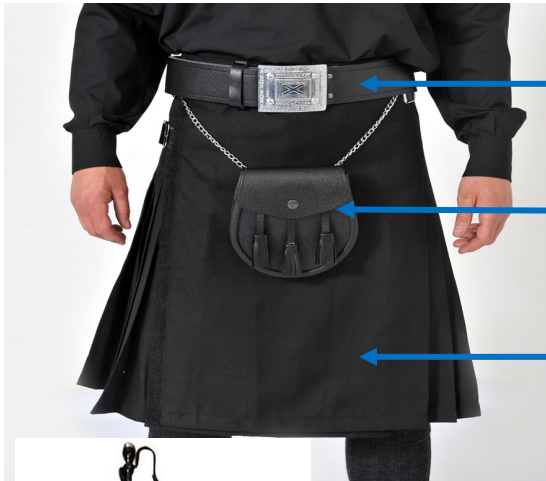
a leather belt