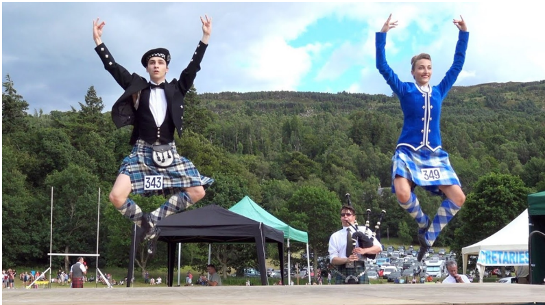
a dance: the Highland fling

Highland games are events held in spring and summer. They celebrate Scottish culture.