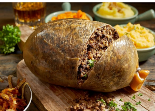
Haggis (pance de brebis farcie)