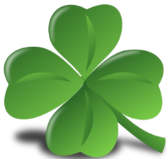
a clover (four leaves)