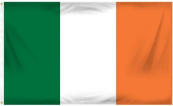
the Irish flag