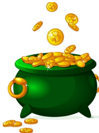
a pot of gold